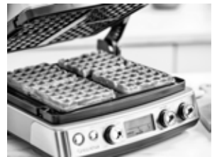
Belgian Waffle plate

(Buy additional Belgian Waffle plates suitable for this Contact Grill!)