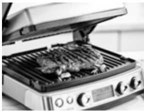
(5A) Grill plate