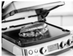
(5B) Teppanyaki plate