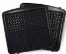
Classic Waffle plate