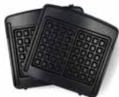
Liège (Brussels) Waffle plate