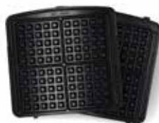
Belgian Waffle plate

(Buy additional Belgian Waffle plates suitable for this Waffle Maker!)